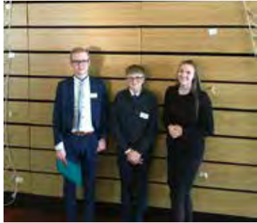
One of the Delegations from Model UN