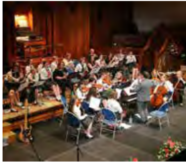
2019 Orchestra Performance at the PTA Summer Concert