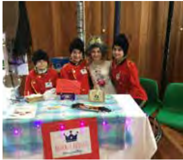
S1/S2 Fairtrade Display