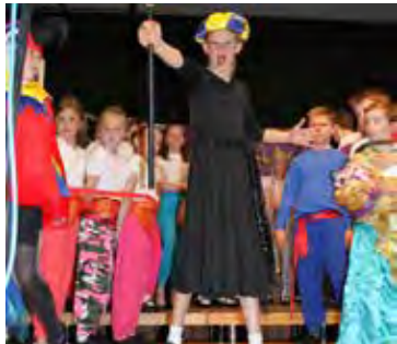
2019 Junior School Performance of Aladdin