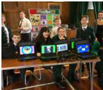
S1/S2 Fairtrade Display