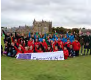
Wellington hosting Eurostronomia partner schools