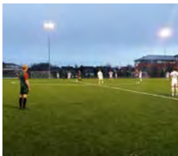
Wellington Football team taking part in the Ayrshire League