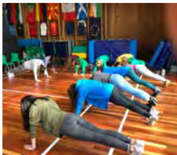
Erasmus Club experiments