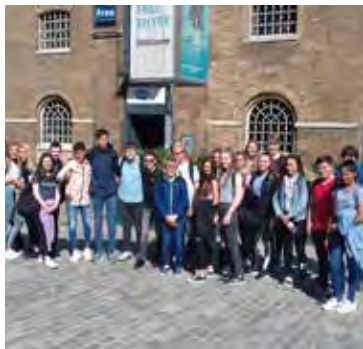
S4 History Trip to the Museum of London Docklands