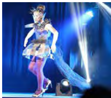
One of the finalist designs Techno Telepathy