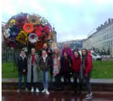
French Senior Exchange Trip in December