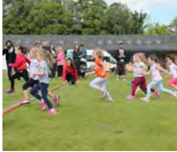
2019 Junior School Sports Day