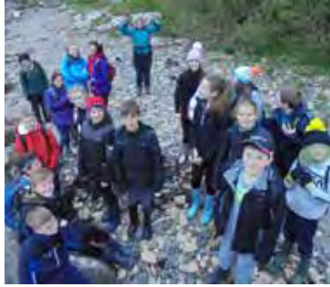
Primary 7 on their Culzean Trip