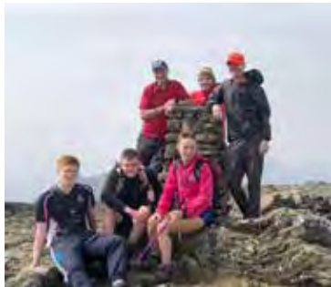
Team Spirit & Team Wellington completing the "Three Peaks Challenge"