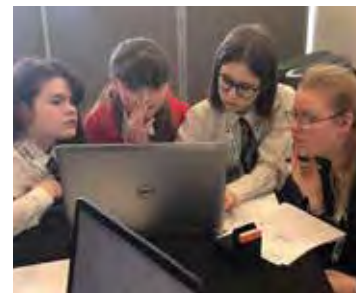
Some of the pupils taking place in the Cyber Treasure Hunt