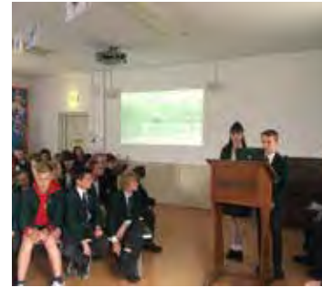
P7 John Muir Sharing Event

We are delighted to see our playground taking shape with the 'docking' of Coconut Jack, our new ship, in the infant playground and the welcome addition of colourful planters as well as the imminent arrival of painted lines for games and activities. We are all looking forward to the next phase of improvements in the playground.