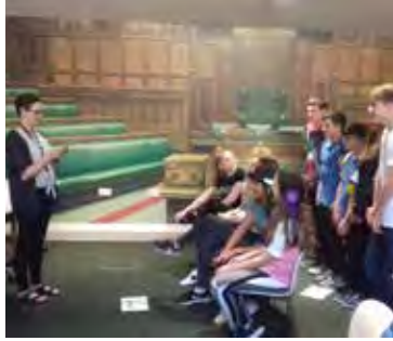
S4 pupils on their tour of the Houses of Parliament