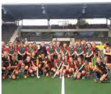
Hockey Tour to Amsterdam