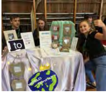
S1/S2 Fairtrade Display