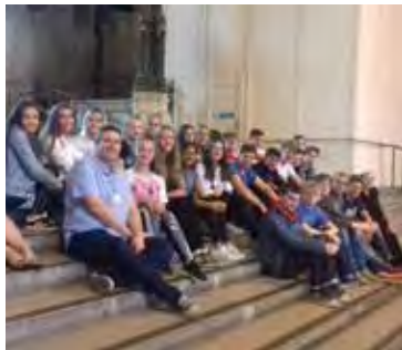
S4 Modern Studies trip to London