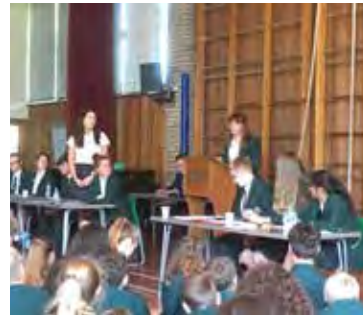
House Churchill Taking their victory in Public Speaking