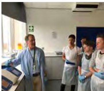
DNA lecture at Glasgow University