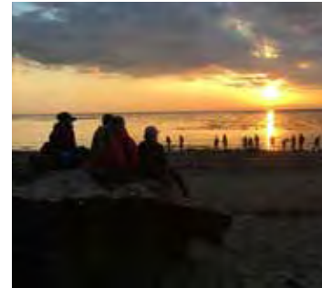
P7 Trip to Culzean