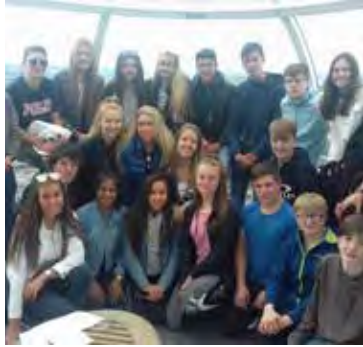
S4 Pupils on the London Eye