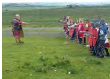
Using armour and weaponry from Roman times.