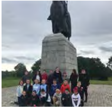
Primary 7 History Trip to the Bannockburn Centre Stirling

Pupils made cross curricular links with French on their study of the French Revolution in both languages and then chose an event from the topic to present their research on speaking both English and French in this activity.