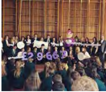
Sixth Year presenting their Charity Cheque to the Ayrshire Hospice