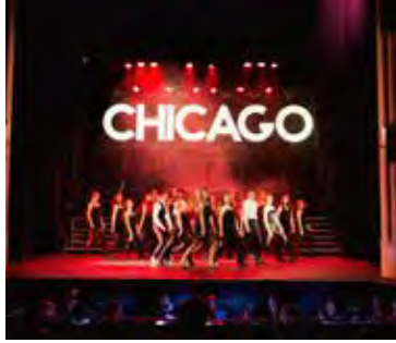
2018 School Production of Chicago