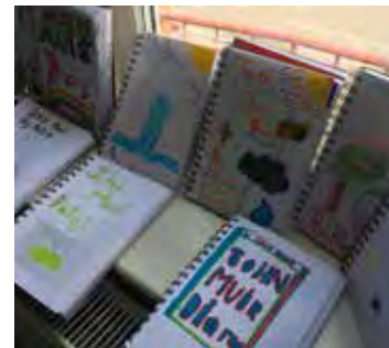
John Muir Activity Books