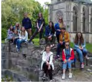
French Junior Exchange Trip in May