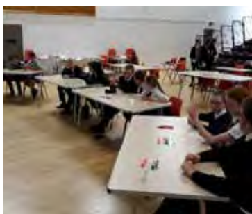
The different team finalists held at Belmont Academy

The annual visit by National 5 students to Drymen and Balmaha, Loch Lomond National Park, took place in June. The new S4 students investigated the impact of tourism on an upland glaciated environment. Pupils were taught how to plan geographical study using a variety of gathering techniques, presentation methods and methods of analysis. This first-hand data collection enabled them to start their individual assignments based on their own hypotheses. The day was spent gathering information on footpath erosion, trample zones vegetation cover, environmental quality, traffic/pedestrian flow, car origins, tourist questionnaires. For several years, the National 5 cohort have enjoyed impressive results, and the superb assignment marks play a significant role in this success.