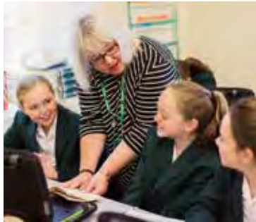
Learning with Chromebooks