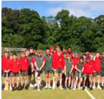
Inter House Cricket