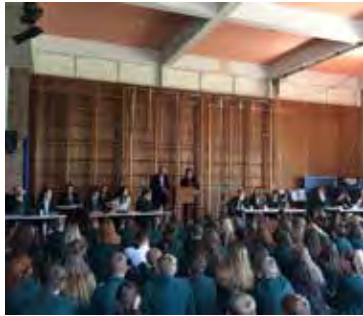
Public Speaking winners being announced