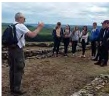
Touring the site of Hadrian's Wall