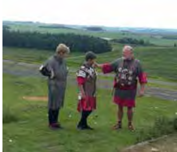
Pupils experiencing being a Roman Soldier